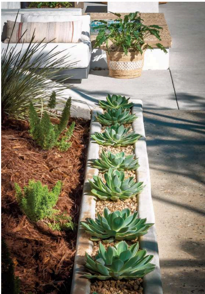
A linear planter filled with succulents creates a welcoming transition from the hardscape to the sloped hillside.