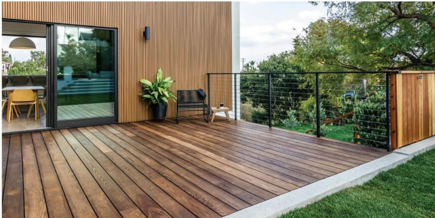
COMPLETED JANUARY 2022

THIS PROJECT'S MODERN DESIGN is simultaneously chic and casual. The garden palette is restrained to allow the home's architecture to shine, while creating privacy, shade and a space for children and dogs to play.