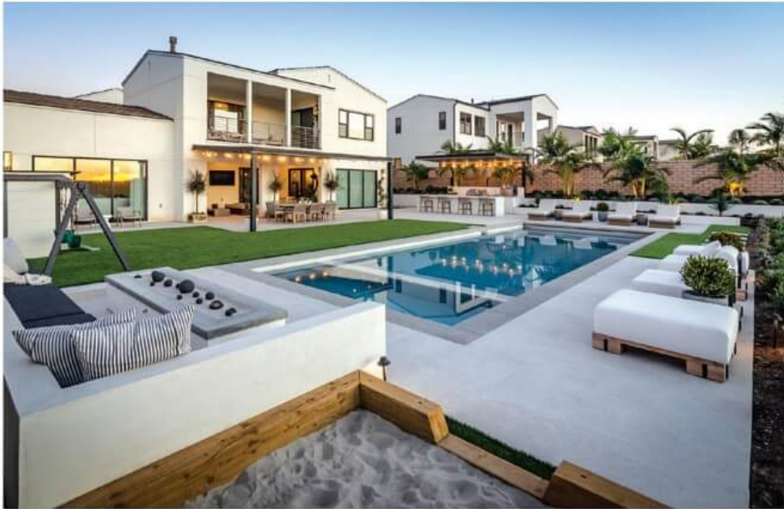
COMPLETED MARCH 2022

FAMILY-FRIENDLY WHILE REMAINING ELEVATED and chic, this home's landscape is modern and Mediterranean. A delightful space for entertaining, it includes many desired exterior features that enhance the Southern California lifestyle.