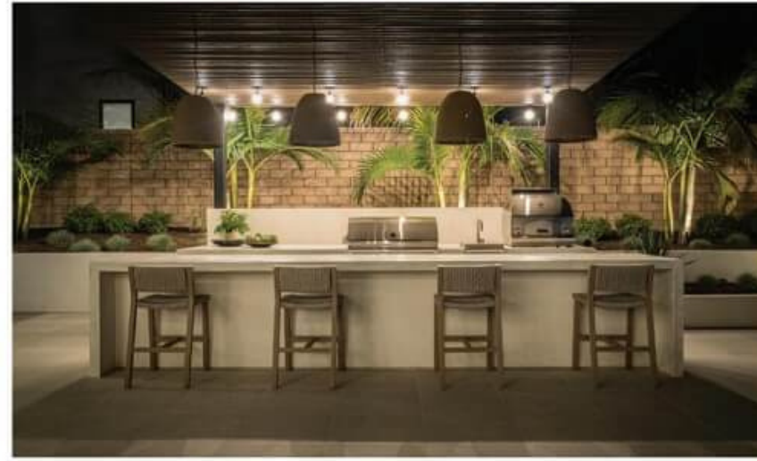
There's plenty of space in this outdoor kitchen featuring Palecek pendant lights hanging from above.